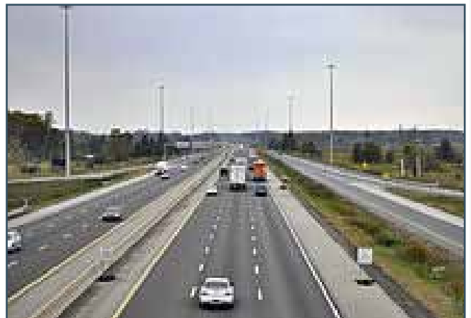
Location & quick access to I-80 helps make TRI Center the west coast logistics hub.