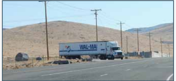
Tahoe Reno Industrial Center is home of some of the largest e-tailers and retailers in the country including Wal-Mart, GSI Commerce, 1-800-Diapers, Toys-R-U's and Zulily.