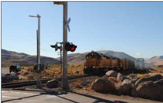
Rail served sites available.