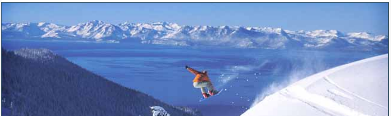
Tahoe is just 30 minutes away with world class skiing, hiking and golfing.