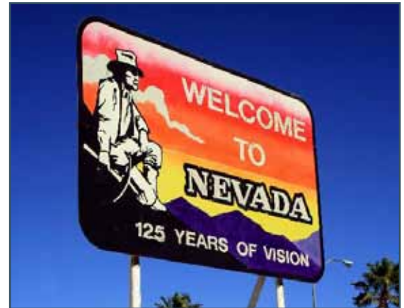
Nevada is pro-growth and pro-business.