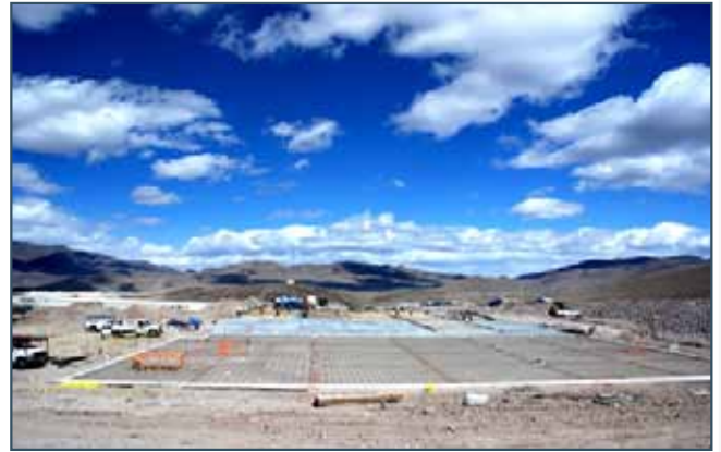
Building permits in 30 days.