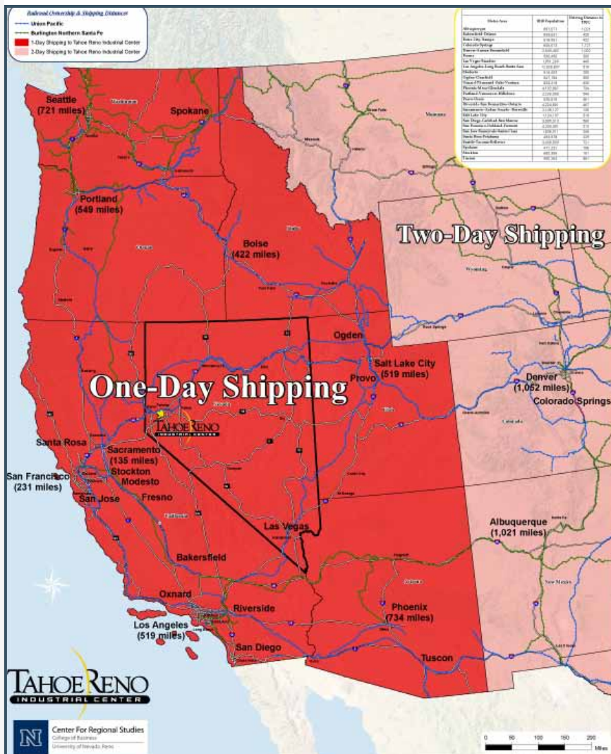
Image above- The Tahoe Reno Industrial Center is just nine miles from Reno/ Sparks with local access to the Reno Tahoe International Airport just 15 miles away. TRI Center has two main interchanges accessing the park off of Interstate 80.