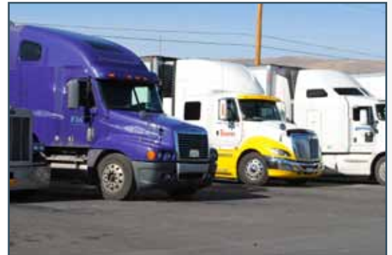
All truck services are available in TRI Center.