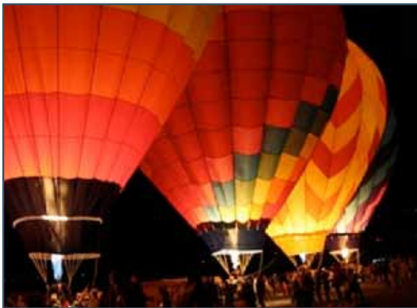
Dawn patrol at the Reno Balloon Races.