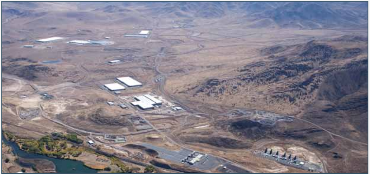
Tahoe Reno Industrial Center has all infrastructure in place with 11 million SF developed in Phase I & II